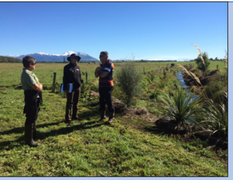
available to support your project.