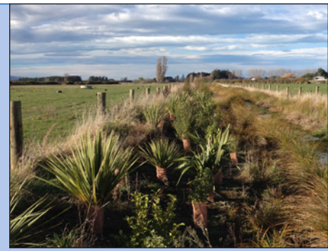
3. Design & plan - A combination of tools will likely be needed over time. Identify your priorities and constraints. Consider costs and labour for initial and maintenance activities for different tools.

Key to success: Check in regularly on your waterway and take necessary steps to maintain any tools that have been applied.