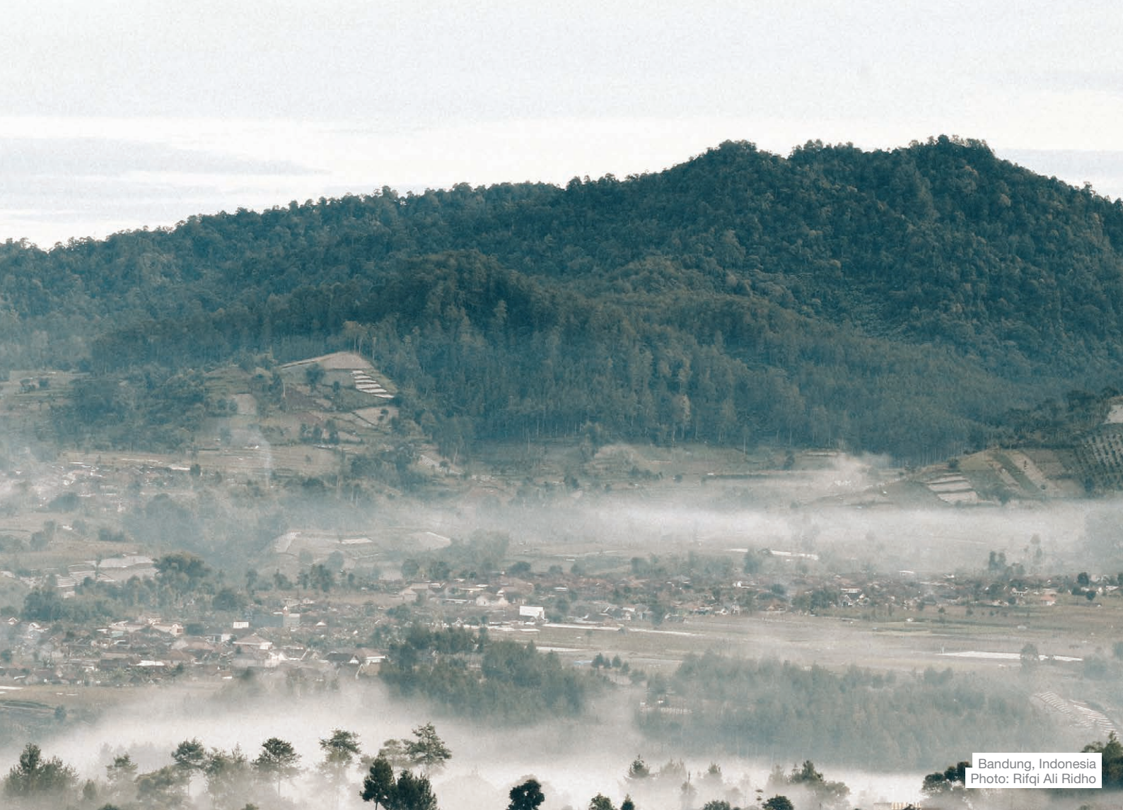
Bandung, Indonesia

of subsistence, or the promotion of conditions of legal and social precariousness. All of these border death sites have clear gendered elements although broken down data on gender is limited. 51 Women are particularly vulnerable crossing borders in environmentally hazardous conditions like maritime crossings (such as the Andaman Sea) and harsh land crossings (for example the Thai- Myanmar border jungles). In such situations, they are often more likely to succumb to physical difficulties such as exhaustion and drowning.