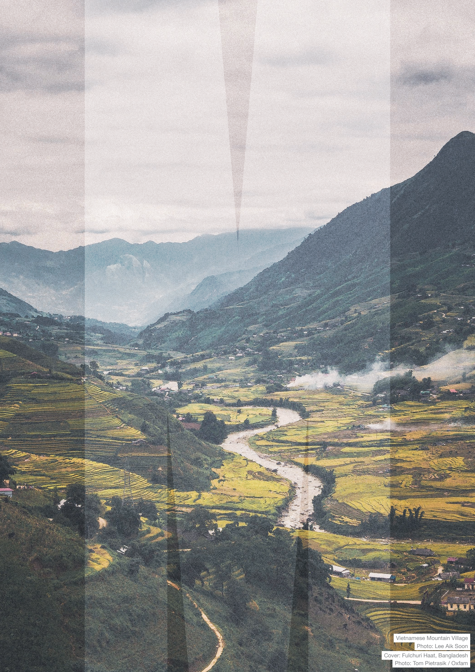
Vietnamese Mountain Village