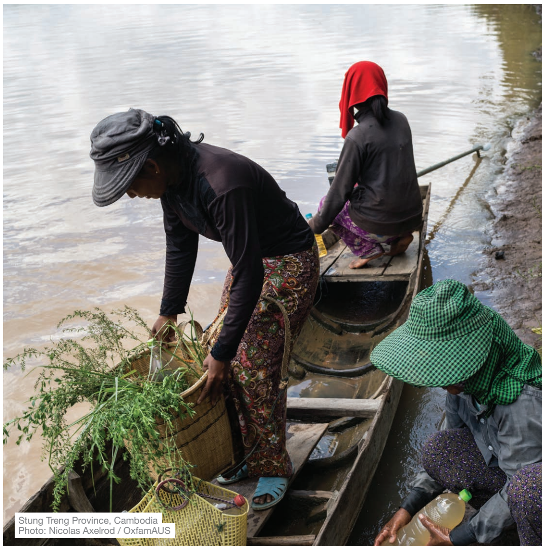
Stung Treng Province, Cambodia