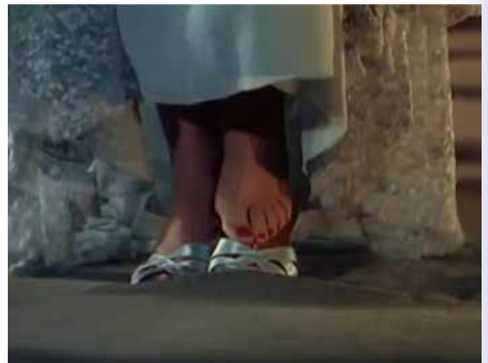
Figure 11, 12 & 14 Women in Various States