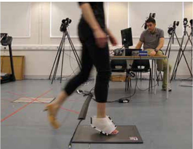
Figure 15 Pressure Mat Testing