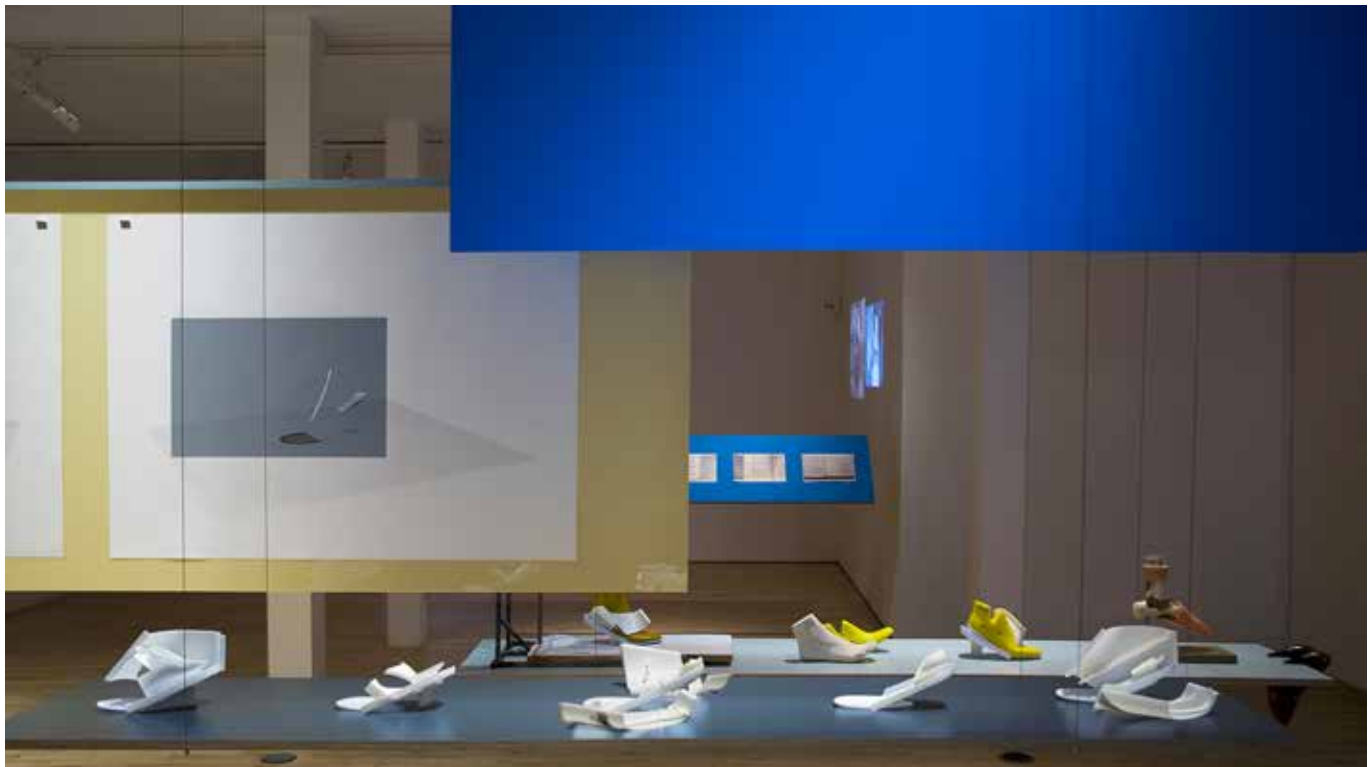
Figure 1. A Measurable Factor Sets the Conditions of its Operation. Exhibition shot.

With this definition in mind, and rejecting the standard, regimented approaches and limiting parameters of the shoe industry as described above, I started from scratch to rethink the method by which shoes are designed. Employing processes drawn from an engineering approach, I set out to design a collection of footwear pieces informed by research into the structural parameters required to support a foot, in a high-heeled position, while in motion. This method purposefully shirks the existing footwear configuration of assembled parts, fashion trends and styles –that which architect and design theorist Christopher Alexander might refer to as “the chosen formal order”. [1] Applying an engineering process to the design of footwear, I imagined, could allow me to create radically different shoe typologies. Congruently, such an approach would foreground the perception that high-heeled shoes are a piece of technology , and in so doing expose the gendering of different disciplines and objects.