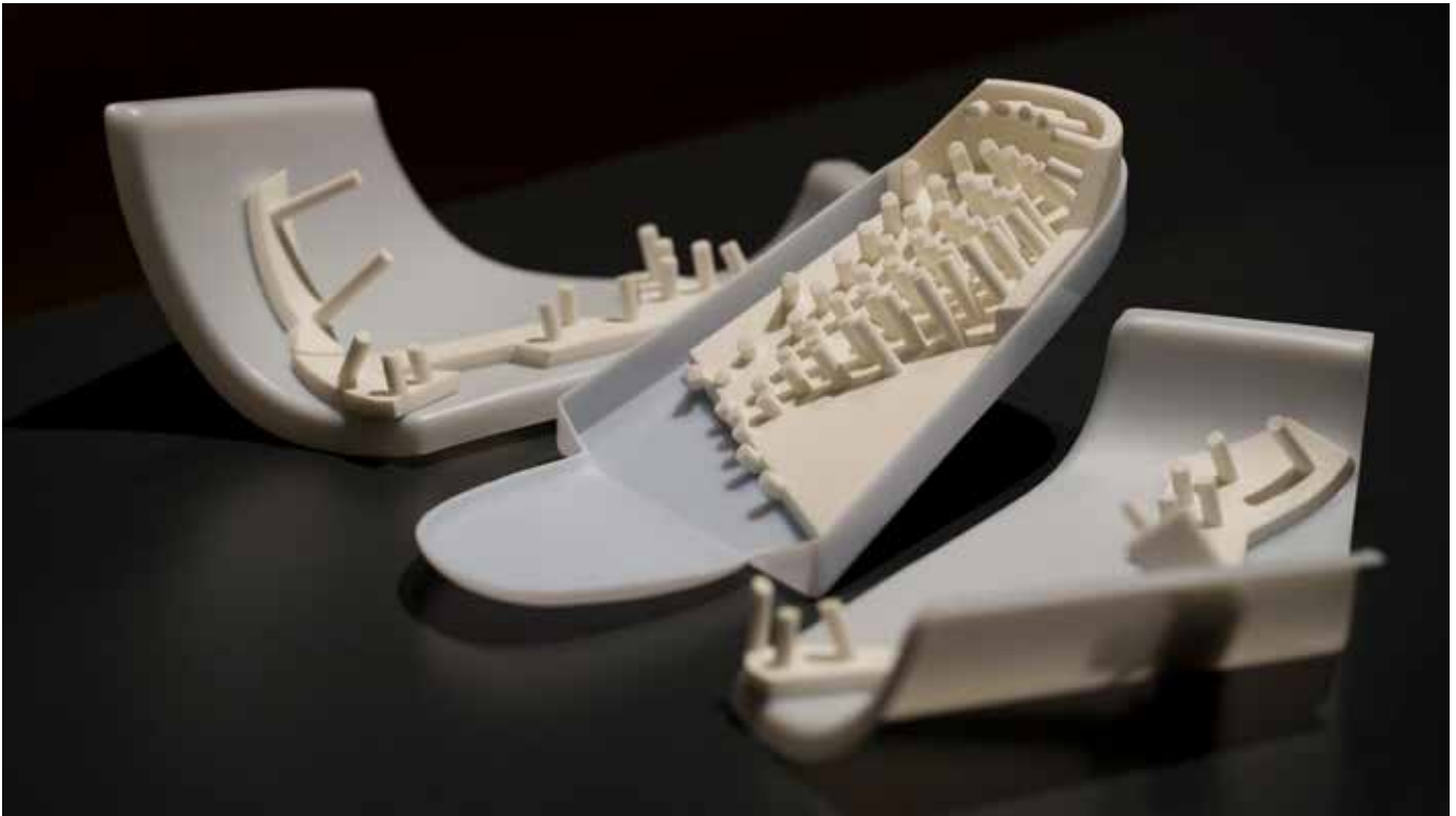
Figure 13 White Prototypes