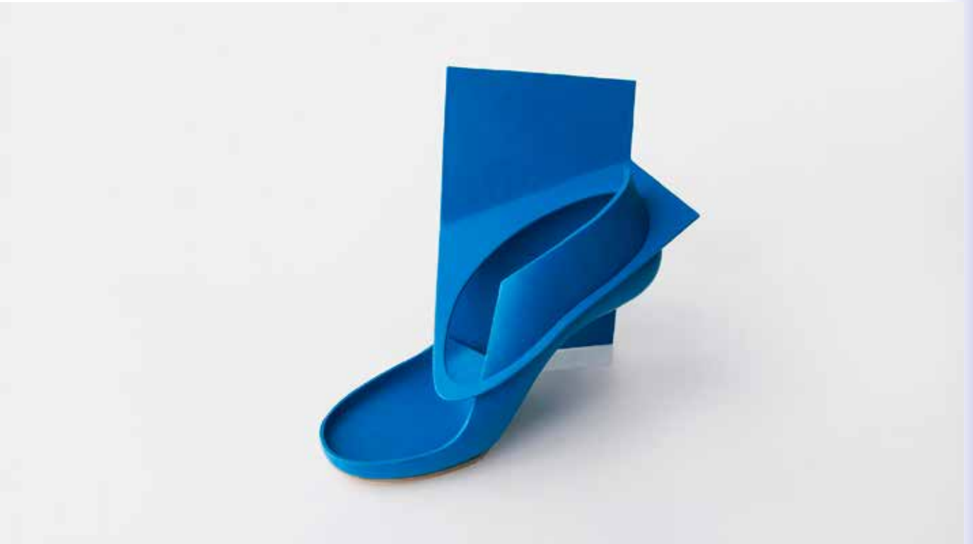
Figure 5 White Prototypes & Figure 6 Bluepanelshoe