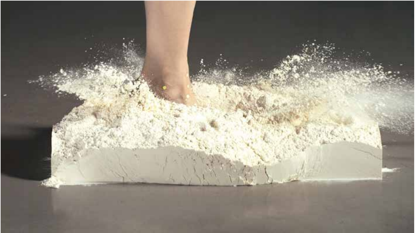
Figure 9 & 10 Material Compulsion Film Stills