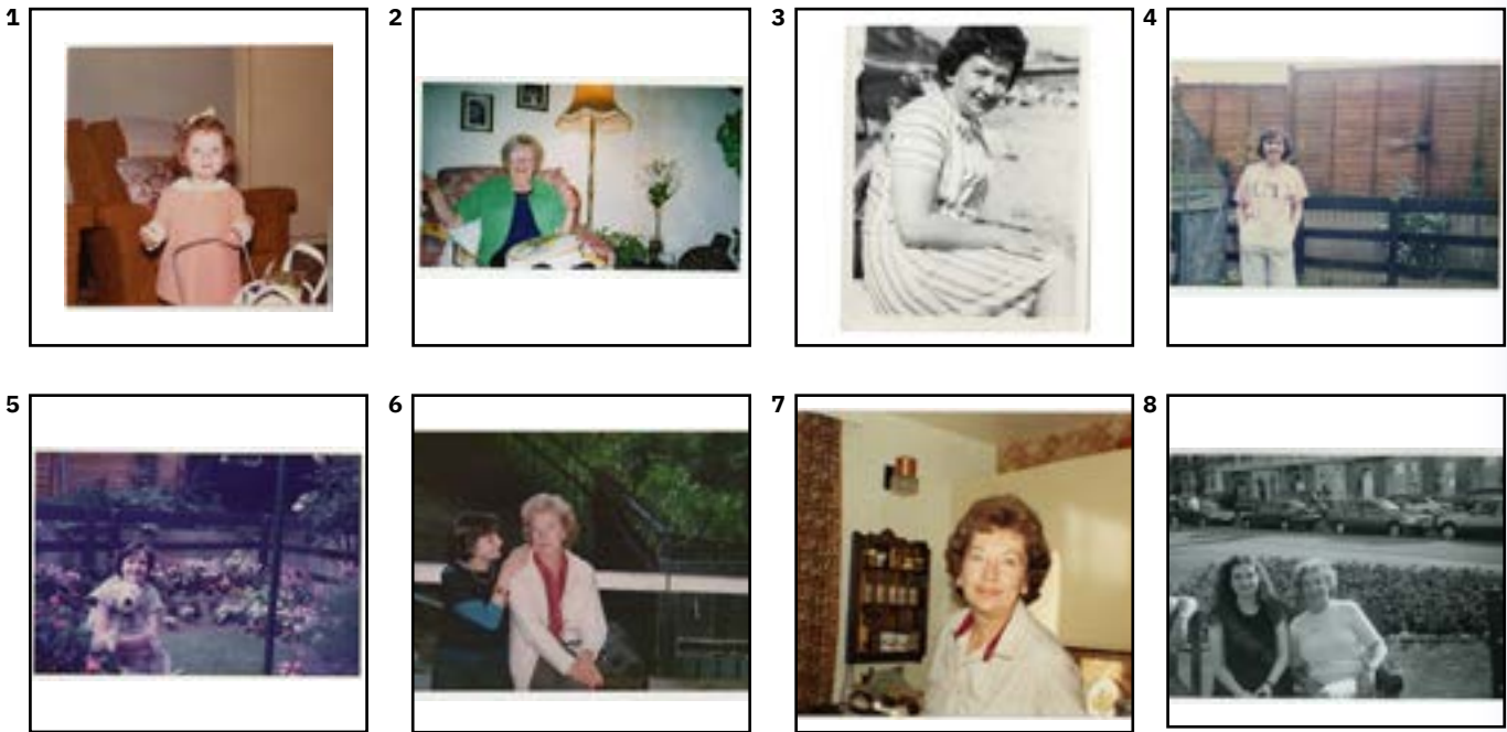
Figure group 2. Personal archive media of 8 images.