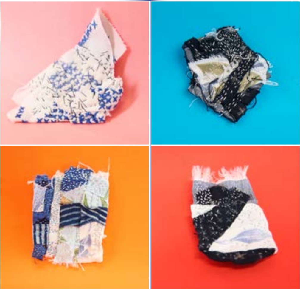
Figure group 1 above. Initial collages.

In order to develop the idea and see how the method could play out we decided to use a small number of eight photographs from the first author's personal archive featuring images of her and her mum over their lives (Figure group 2). Firstly we developed a clear set of rules that we could establish as the key for how the materiality of the fabric collages would direct the manipulation and curation of the media images. Secondly we made a series of 4 new fabric collages that purposefully responded to this set of rules. And thirdly we developed a process by which areas of a collage would relate to certain images from the archive and how these would be curated sequentially. We now detail each of these three aspects to the method.