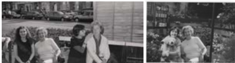
Figures 10 and 11 above.

Without hesitation I can say that the merging of images - following both composition rule 02 and 04 had the strongest effect on me. As I hadn't made the changes to the images I wasn't sure what creative decisions would be made in merging them and on seeing the results it felt almost as if I was seeing these photos as something new, which was a very strange feeling as I know them so well. Being confronted with a newness from what felt to be a finite archive is an exciting prospect. The compositions in Figures 10 & 11 in particular present not only new narratives (that I can read into them), but also impossible scenarios where my mum and I are with each other at different stages of our lives and even together with our younger selves.