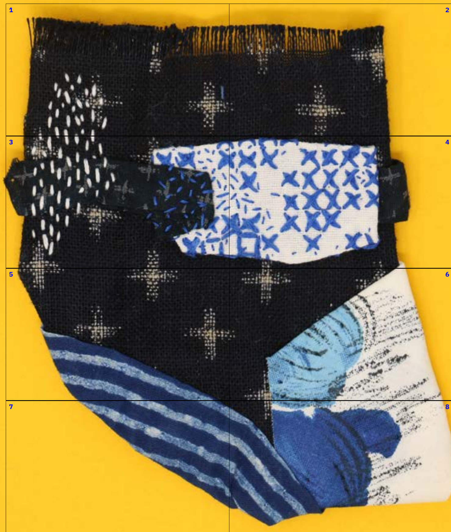
Figure 9 r Jayne Wallace, Nantia Koulidou. ight. Blueprint Collage 03. Photo: Jayne Wallace, Nantia Koulidou.

Figure group 8 left. Resulting images and sequence dictated by Blueprint Collage 03. Photo: Jayne Wallace, Nantia Koulidou.