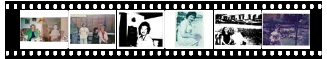
Figure group 5 above. Sequence of resulting images.

Below is the first resulting collage made in relationship to the rules and Figure group 4 steps through how the materiality of this collage directed composition of the resulting images. The sequential ordering of the resulting images was dictated by the stitching as denoted by Figure 5.