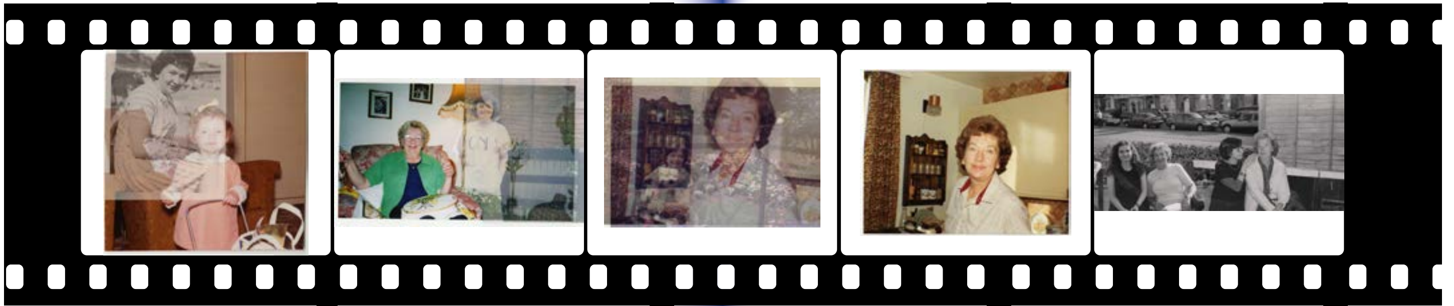
Figure group 6 above. Blueprint Collage 02. Resulting images and sequence dictated by the collage.