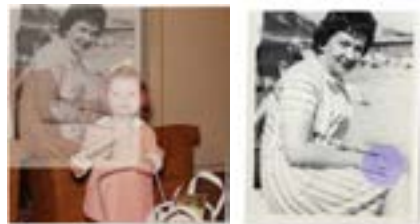
Figure 12 and 13 left.

Similarly the particular placement of images in Figure 12 struck a chord with me as it shows a physical connection (the hand resting on the shoulder) that means something to me. And the highlighted area (composition rule 03) seems very intriguing (Figure 13). It caused me to think of reasons why that area would be highlighted, what this suggested and in turn I found myself creating new narratives or meanings around this.