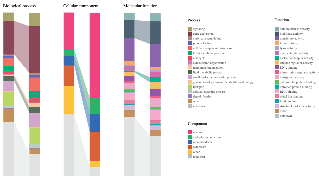
Figure 2 Effect of curation on S. japonicus GO annotation coverage. Comparison of the distribution of annotations for all S. japonicus protein-coding genes (4896 total) to selected high-level terms in each aspect of GO between the UniProt GOA file ("before"; left-hand columns) and the JaponicusDB GO annotation set ("after"; right-hand columns). The number of annotated proteins has increased for most MF, BP, and CC, with associated decreases in the proportions of proteins annotated as "unknown." Highlighted blocks represent GO terms relevant to processes that are intensively studied in S. japonicus : "gene expression," "membrane organization," and "lipid metabolism" in BP; "endoplasmic reticulum" and "mitochondrion" in CC; and "hydrolase activity" and "molecular adaptor activity" in MF. Images were generated using QuILT (Harris et al., in this issue), in which only one term per gene can be included for display. If a gene is annotated to more than one GO term, one is selected according to a set order of precedence. Here, terms are arranged by order of precedence in the charts and key for each GO aspect.