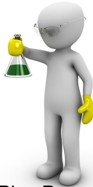
PI or Researcher