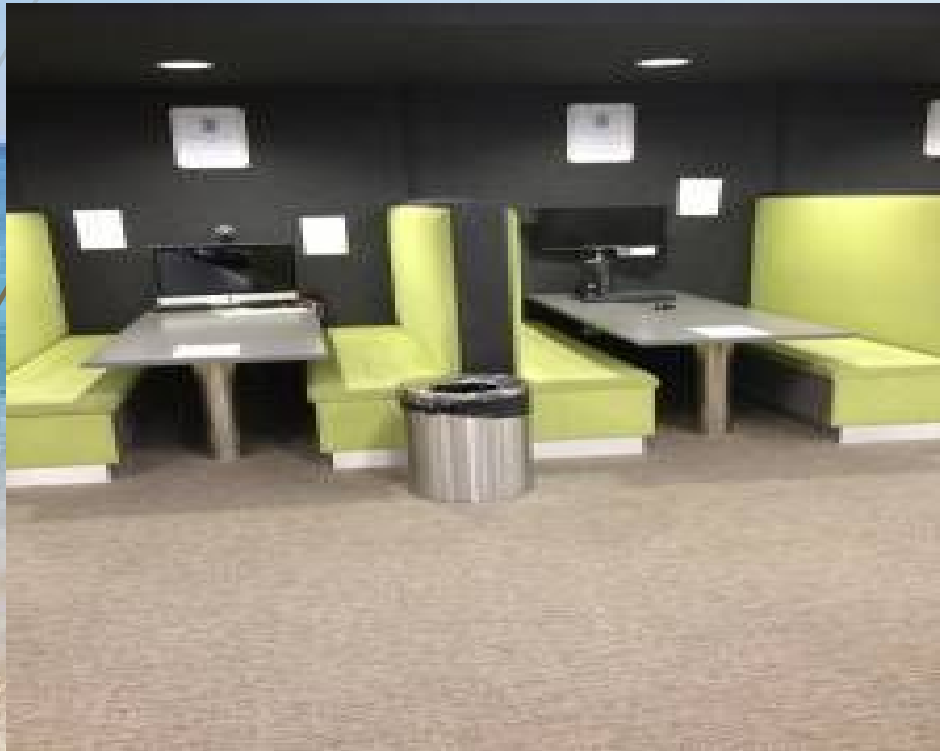
Library Design Image from Pinterest