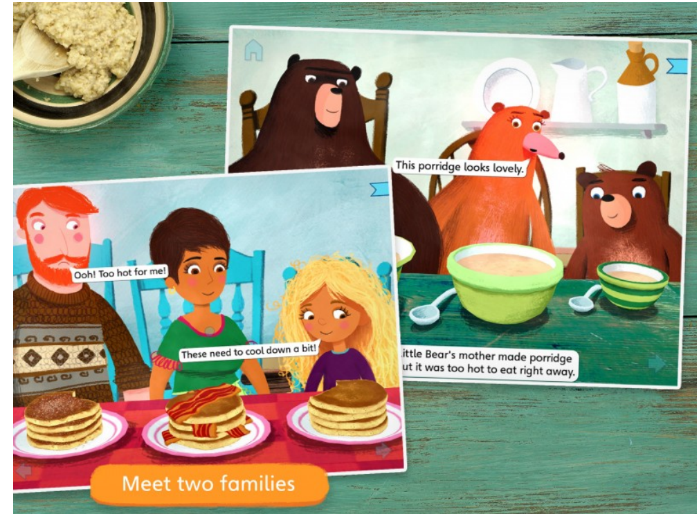
Goldilocks and Little Bear by Nosy Crow