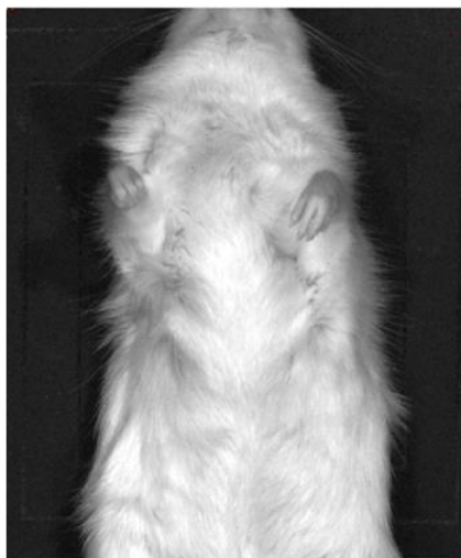
(a) Fasted for 24 h